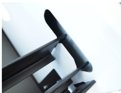
it is of very easy placement.